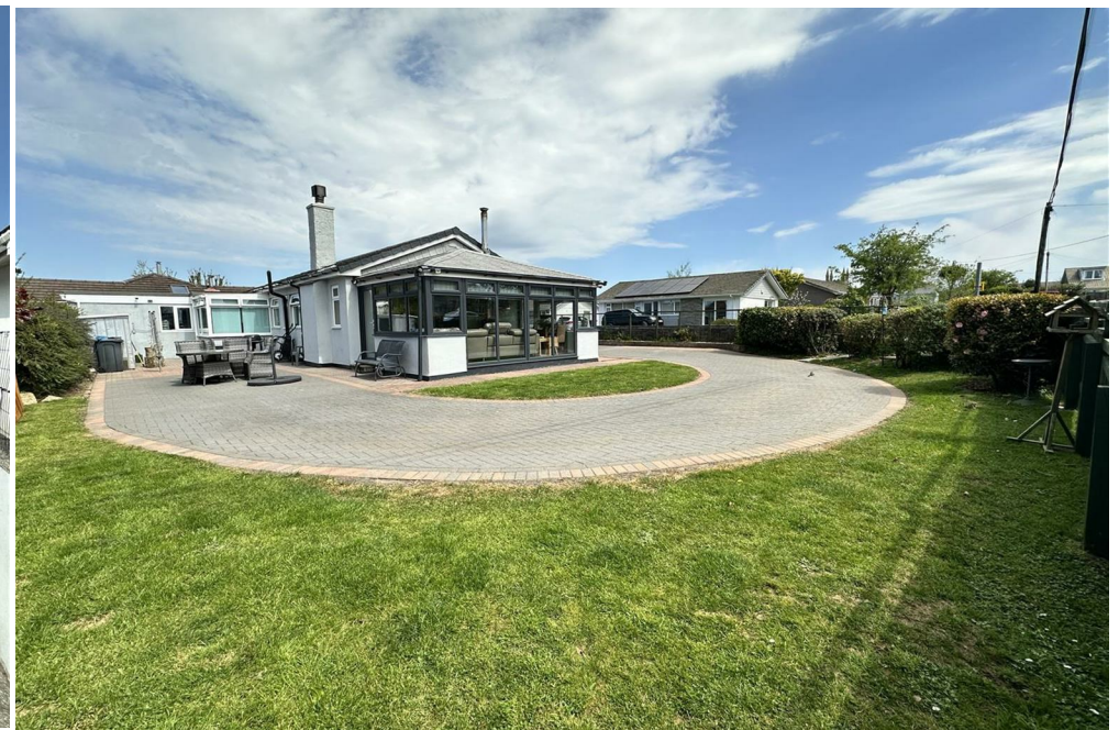
Caradon View, St. Cleer, Nr Liskeard, PL14 5DW